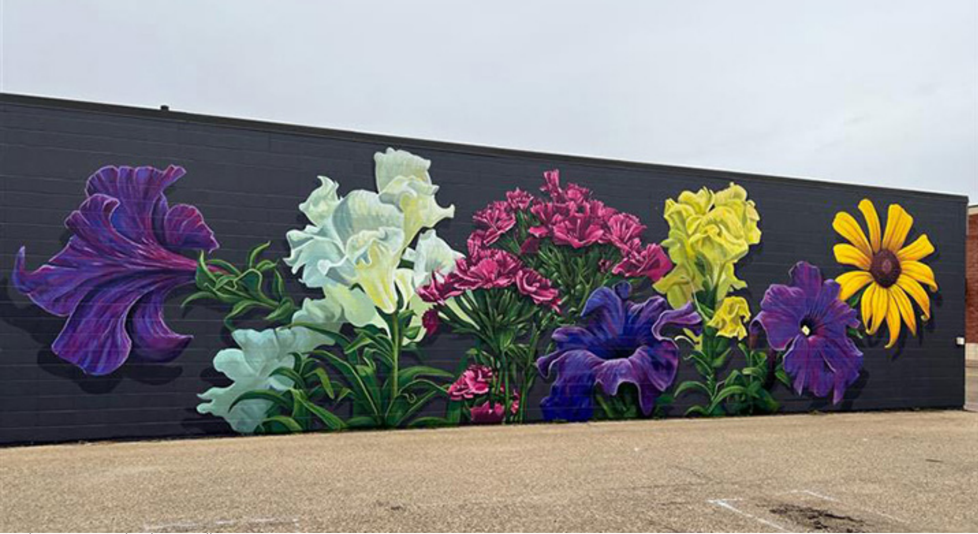
"In Bloom" - Fort Saskatchewan, Alberta