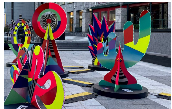
Blumenthal Arts Pop-Up - Charlotte, North Carolina