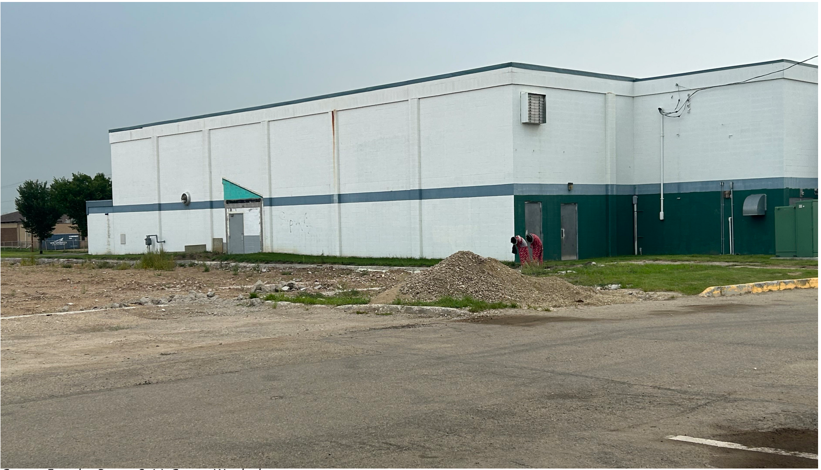
Current Facade - Rotary Spirit Centre, Westlock