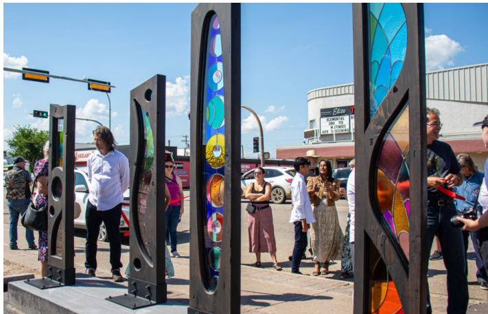
Be the Light - St. Paul, Alberta