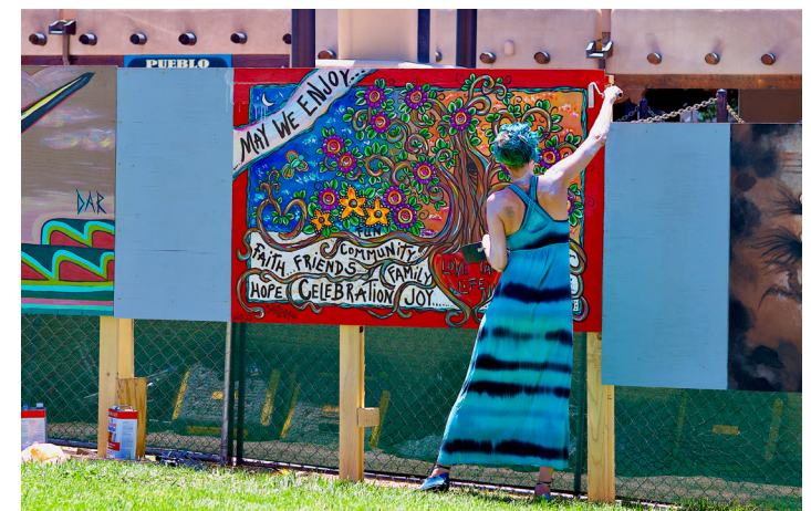
Paseo Project - Taos, New Mexico

Temporary art can also be inexpensive and easy while still providing a large impact. Temporary art is also an opportunity for collaboration with the community, such as local schools, to allow art and the community to evolve together.