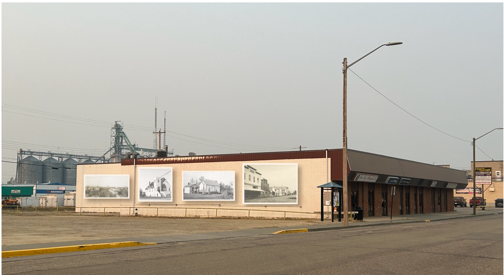
Historical Mural Mock-Up - Towne Centre Building, Westlock

To capitalize on the existing pedestrian traffic and encourage the injection of activity into the Downtown core, Westlock could focus on blank facades as priority locations for mural installations. These murals can showcase Westlock's history and people, with suggested themes including its agricultural history and tributes to historical buildings or people (ie. the Alberta Wheat Pool elevator or Roxy Theatre).