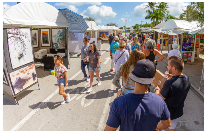
Coconut Art Festival - Miami, Florida