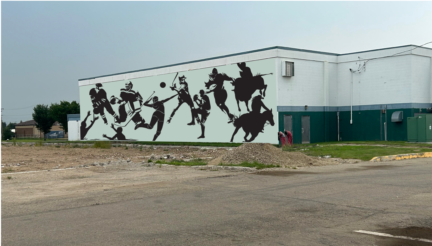
Sports Mural Mock-Up - Rotary Spirit Centre, Westlock

Following the recent demolition of the Jubilee Arena, a large blank façade now exists on the west side of the Curling Rink. To showcase Westlock's sport history, a mural to pay tribute to local sports would serve as a showpiece for this precinct.