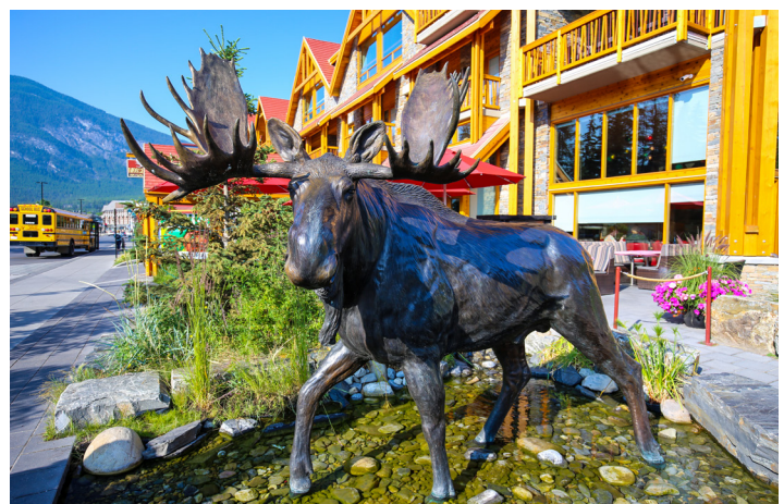
Moose Statue - Banff, Alberta

Murals can allow for the exposure of many artists over a shorter period of time. They are also a simple way to reimagine un-inspiring spaces such as blank facades or alleyways.