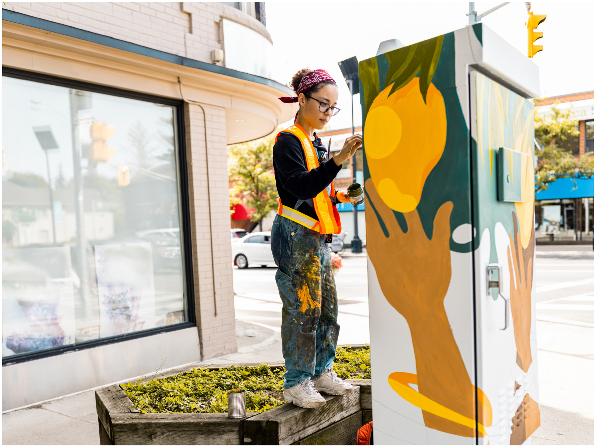
Utility Box Mural - Toronto, Ontario