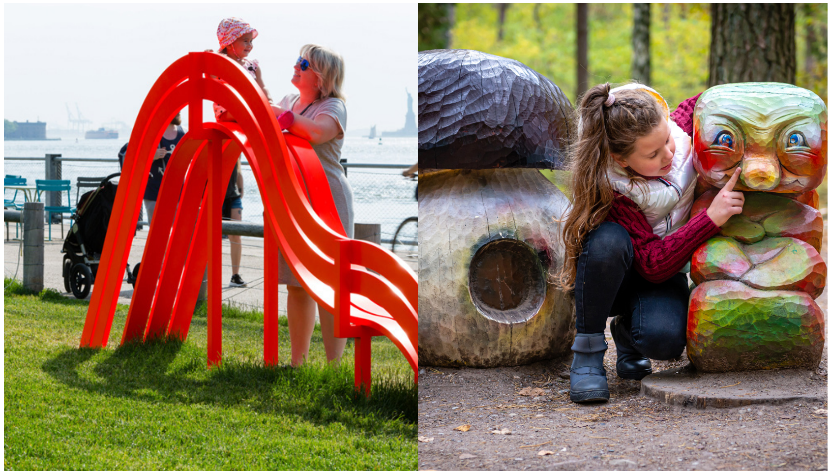
Modified Social Bench - New York, New York

A piece or pieces of playable public art could be installed on the Westlock Aquatic Centre site. This public art would be functional and allow for a place for families to interact while their children play.