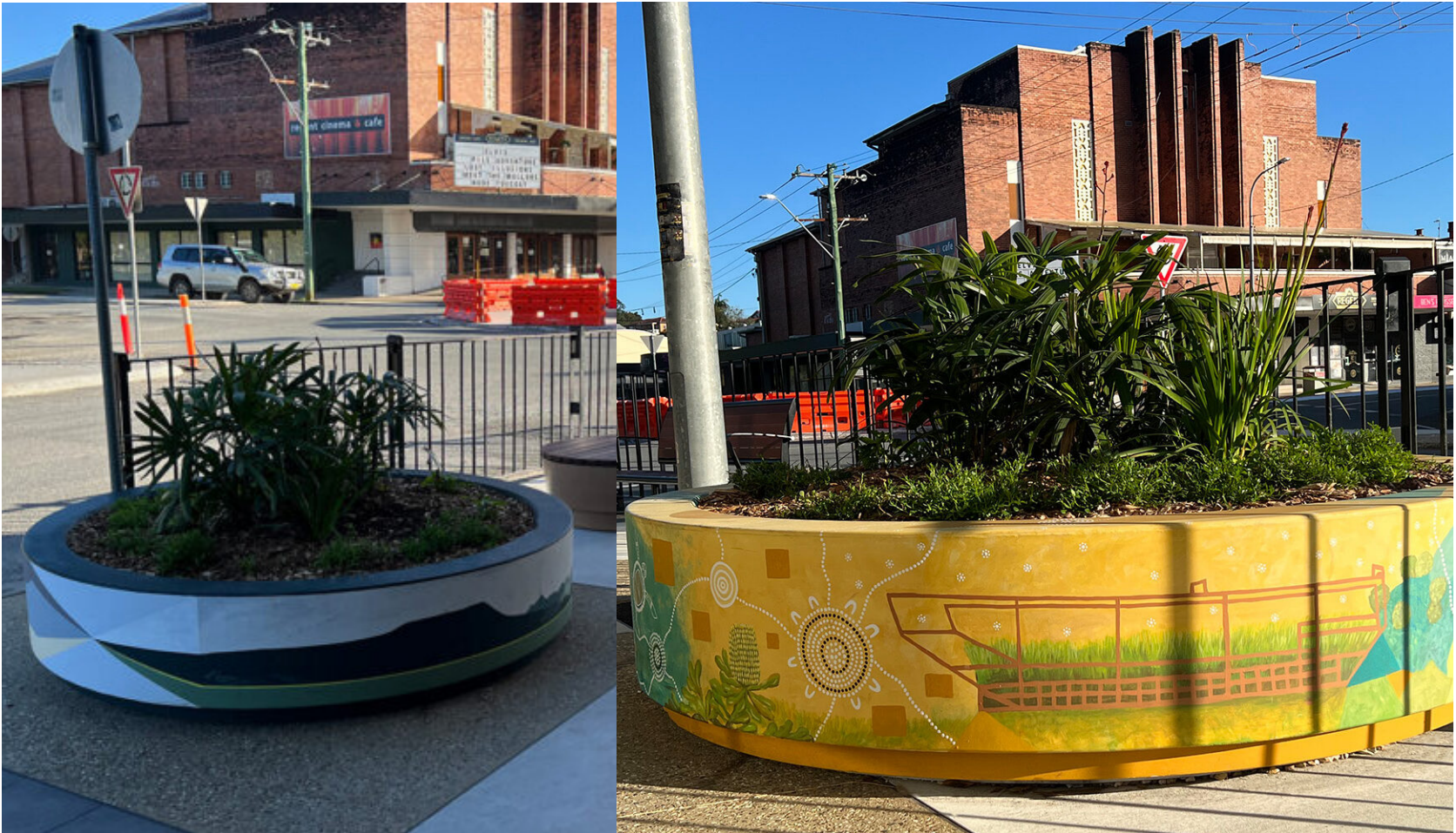
Planters as Public Art - Murwillumbah, Austrailia

Westlock is fortunate to be located on the intersection of Highways 18 and 44, allowing for considerable vehicular traffic from both residents, visitors and the traveling public. Placing public art at these key gateways would serve to welcome people to Westlock and set a positive first impression.