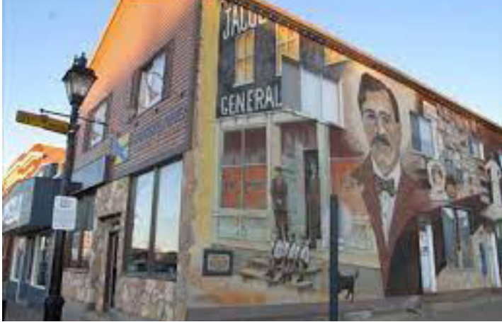
General Store Mural - Stony Plain, Alberta